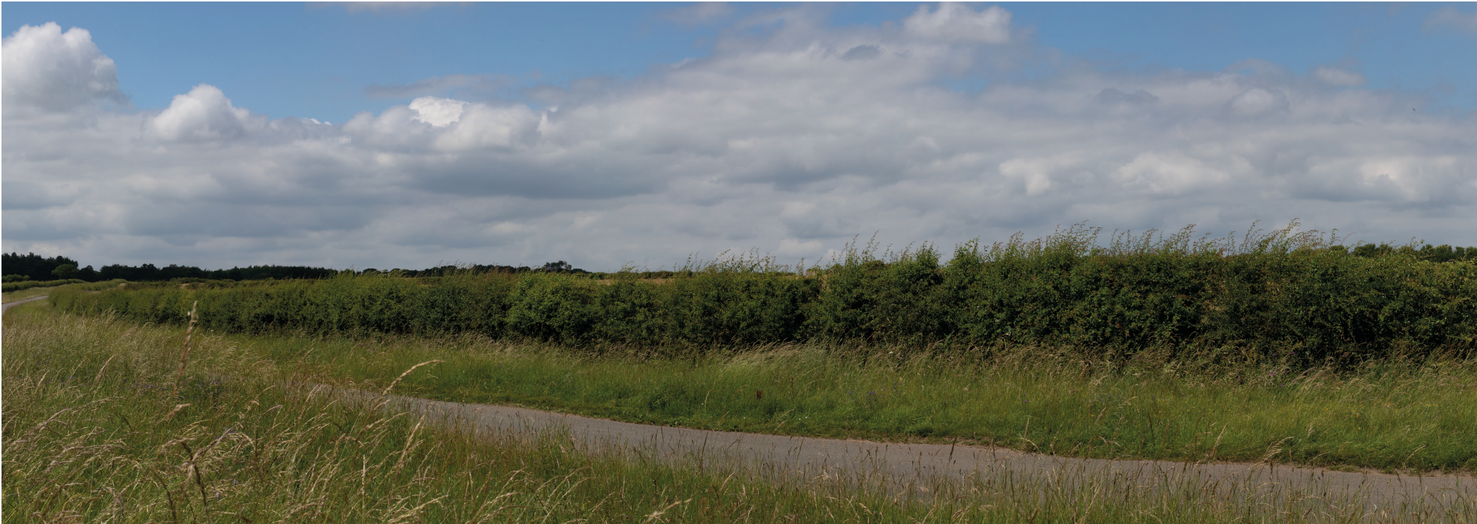
Illustrative Viewpoint A (Right) - Illustrative Viewpoint A - Holywell Lane between Little Warren, Vale Farm and Crossroads Spinney