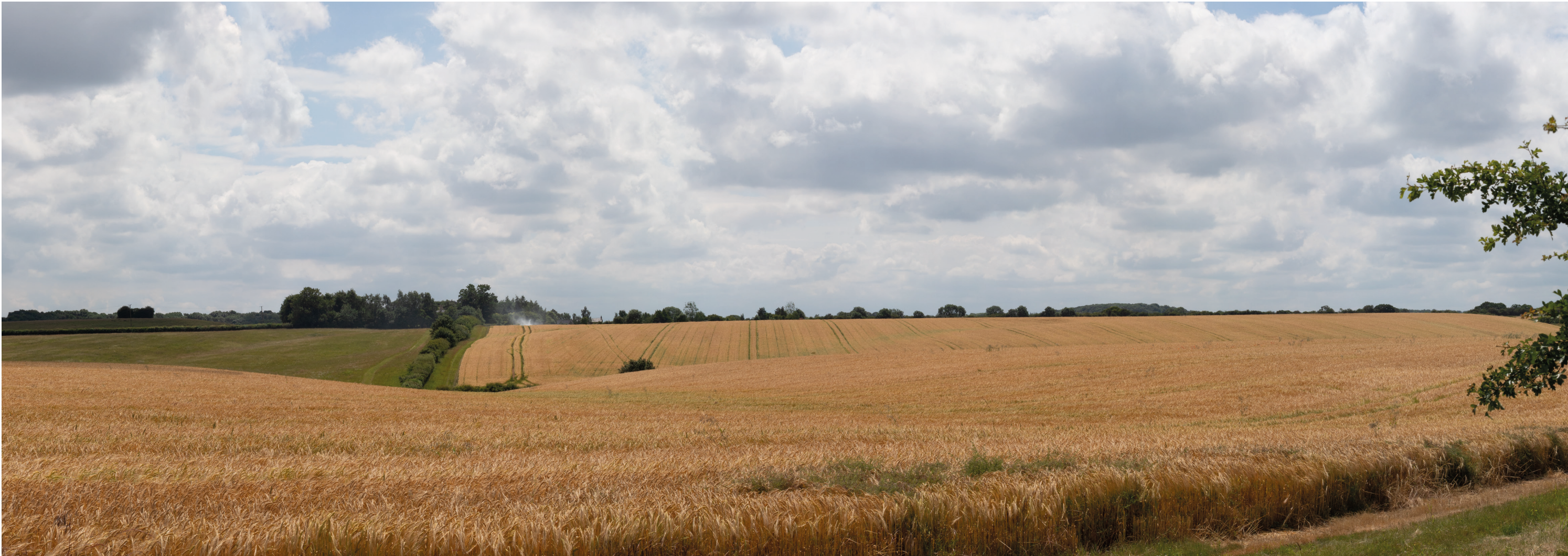
Illustrative Viewpoint A (Left-centre) - Illustrative Viewpoint A - Holywell Lane between Little Warren, Vale Farm and Crossroads Spinney